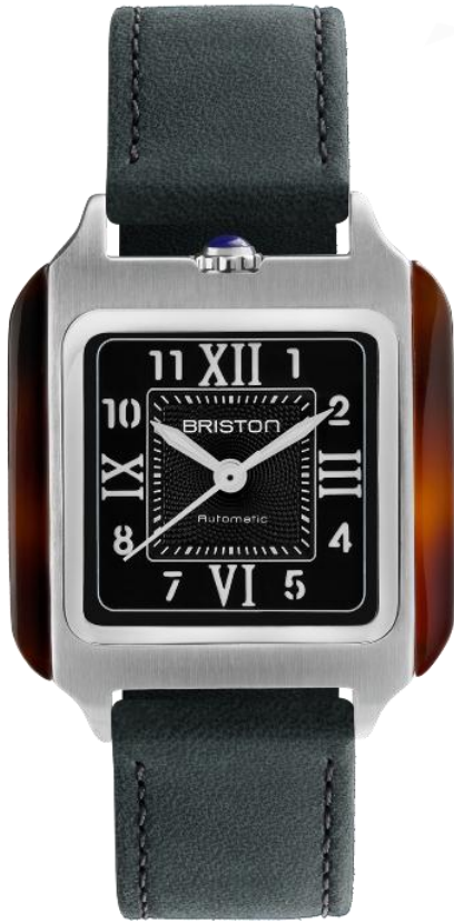
HMS Automatic 251936.SA.T.1.CH NEW PRODUCT MAY 2025