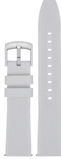
WHITE Steel buckle RF20.W 70$ NEW