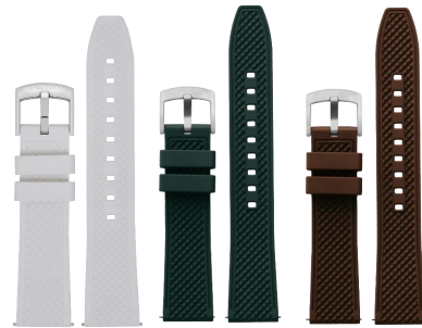
FKM rubber straps 75/115mm – 20mm - 3 references