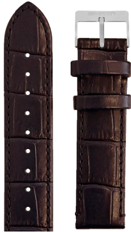
Brown imitation alligator Polished steel buckle L18.ABR 85$