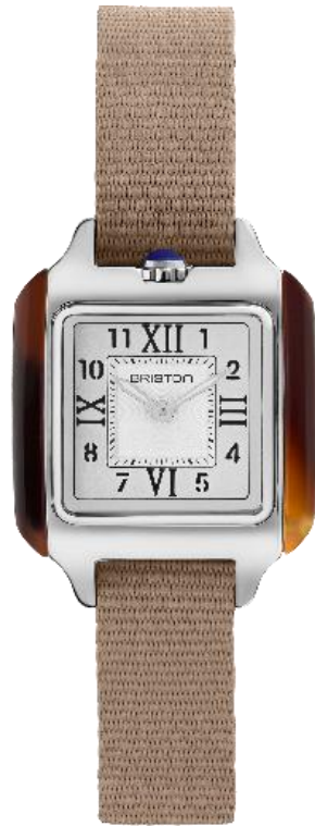
HM Swiss Quartz 252025.SA.T.2.NT NEW PRODUCT MAY 2025