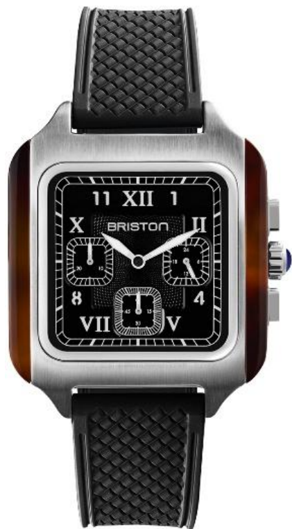
Chronograph 251838.SA.T.1.FB NEW PRODUCT MAY 2025