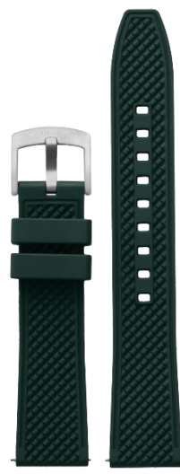
BRITISH GREEN Steel buckle RF20.BG 70$ NEW