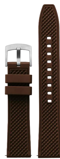
BROWN Steel buckle RF20.BR 70$ NEW