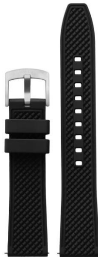
BLACK Steel buckle RF20.B 70$