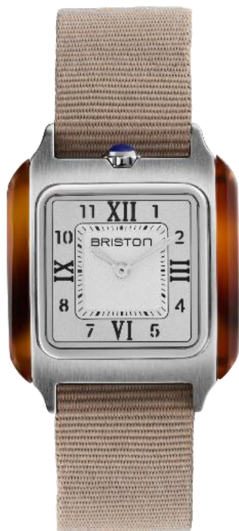
HM Swiss Quartz 252030.SA.T.2.NT NEW PRODUCT MAY 2025