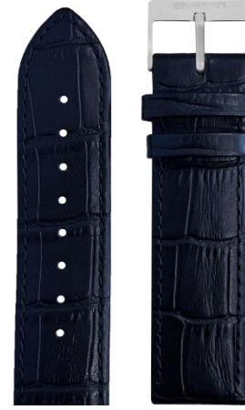
Navy blue imitation alligator Polished steel buckle L20.ANV 85$