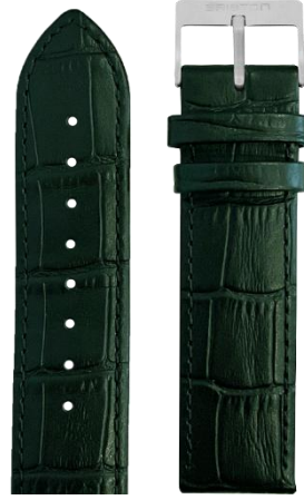
British green imitation alligator Polished steel buckle L20.ABG 85$