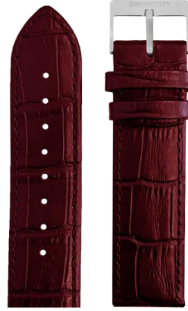
Burgundy imitation alligator Polished steel buckle L20.ABDX 85$