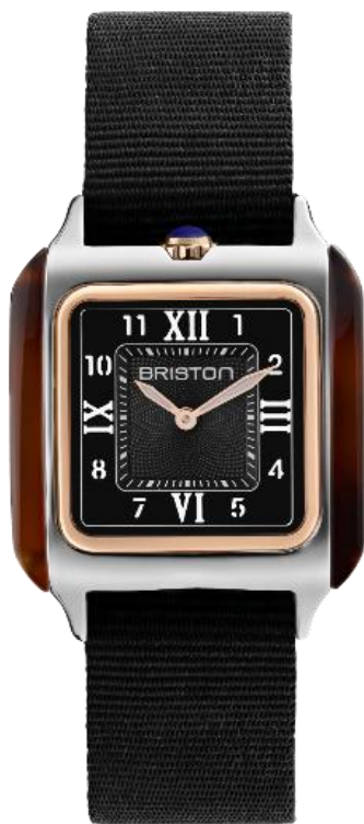
HM Swiss Quartz 252030.PRA.T.1.NB NEW PRODUCT MAY 2025