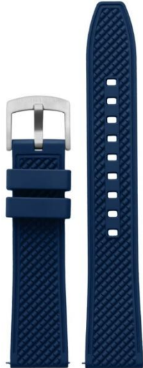
NAVY BLUE Steel buckle RF20.NV 70$