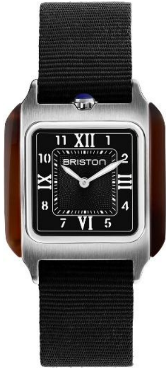
HM Swiss Quartz 252030.SA.T.1.NB