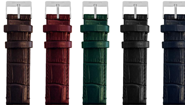
Calfskin alligator leather straps 70/115mm – 18mm - 5 references