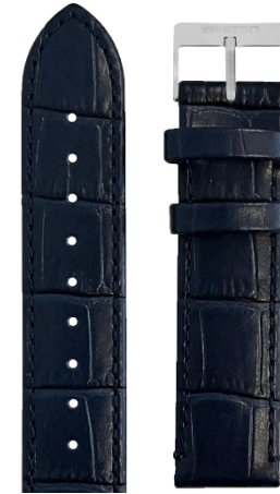
Navy blue imitation alligator Polished steel buckle L18.ANV 85$