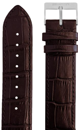
Brown imitation alligator Polished steel buckle L20.ABR 85$