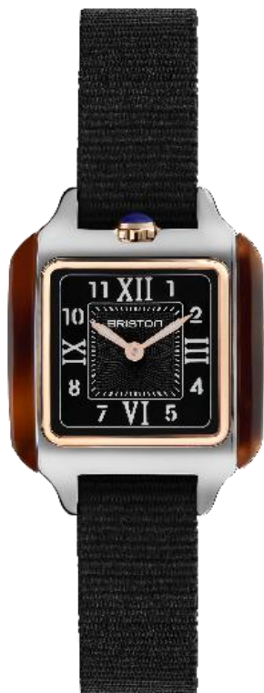
HM Swiss Quartz 252025.PRA.T.1.NB NEW PRODUCT MAY 2025