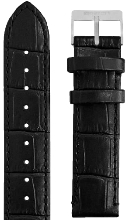
Black imitation alligator Polished steel buckle L18.AB 85$

New traditional 2-part strap in matt alligator pattern (calfskin leather) and equipped with the presto system (pumps with spring) to remove it Pin buckle in polished steel with BRISTON engraved Interchangeable and adaptable to all our Clubmaster Chic and Streamliner Kennedy Medium models with 18mm space between lugs Length: 70 / 115mm - Width: 18mm Available from May 2025