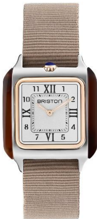
HM Swiss Quartz 252030.PRA.T.2.NT NEW PRODUCT MAY 2025