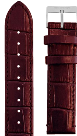
Burgundy imitation alligator Polished steel buckle L18.ABDX 85$