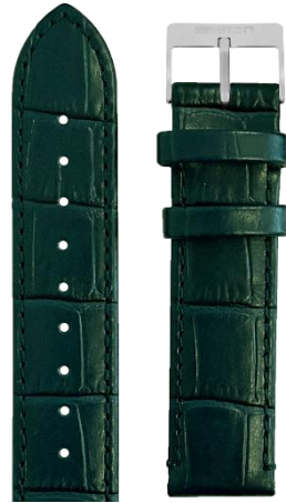
British green imitation alligator Polished steel buckle L18.ABG 85$