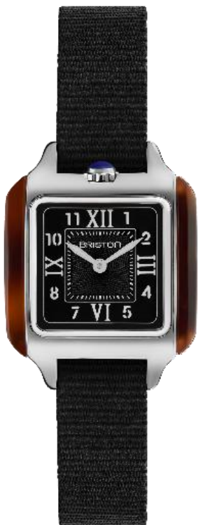
HM Swiss Quartz 252025.SA.T.1.NB NEW PRODUCT MAY 2025