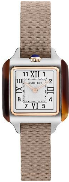
HM Swiss Quartz 252025.PRA.T.2.NT NEW PRODUCT MAY 2025