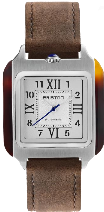
HMS Automatic 251936.SA.T.2.C