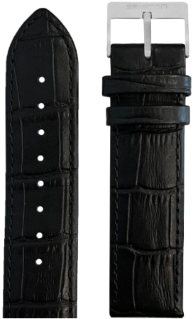
Black imitation alligator Polished steel buckle L20.AB 85$